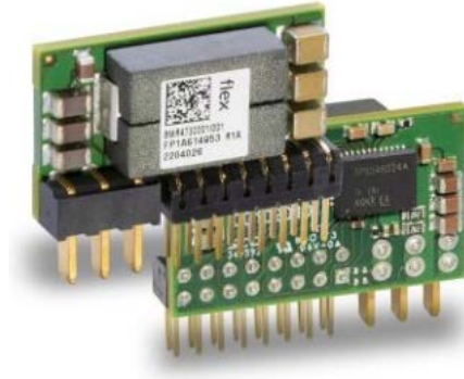
Picture 4 BMR473 product SIP size: 26.3 x 8.8 x 15.6 mm (1.035 x 0.346 x 0.614 in)

https://flexpowermodules.com/resources/fpm-techspec-bmr473