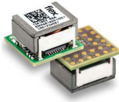
Picture 3 BMR461 product Size: 12.2 x 12.2 x 8 mm (0.48 x 0.48 x 0.315 in)

https://flexpowermodules.com/resources/FPM-TechSpec-BMR461-RevK.pdf