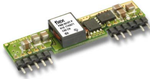
Picture 1 PMB product Size: 50.8x8.5x13.2 mm (2.00 x 0.33 x 0.52 in)

For more information about PMB series, please see: https://flexpowermodules.com/resources/fpm-techspec-pmb4000 https://flexpowermodules.com/resources/fpm-techspec-pmb8000