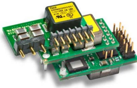
Picture 4 BMR463 product SIP size: 26.3 x 7.6 x 15.6 mm (1.035 x 0.30 x 0.614 in) Laydown size: 25.65 x 13.8 x 8.2 mm (1.01 x 0.543 x 0.323 in)

https://flexpowermodules.com/resources/fpm-techspec-bmr463